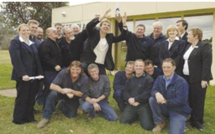
Jim Stynes with Western Water graduates